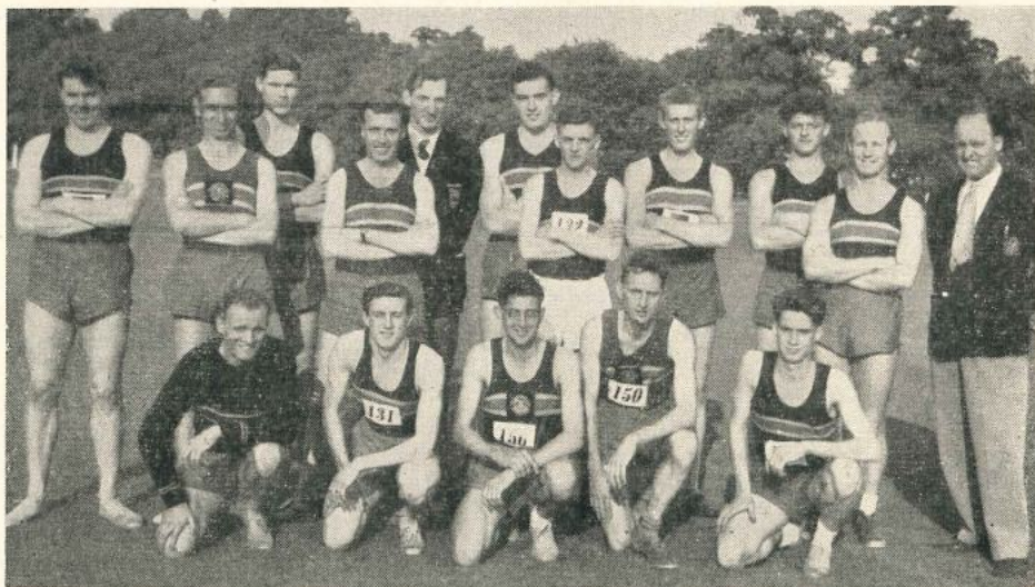
The Walton A.C. team which won the Battle of Britain Trophy at Uxbridge.