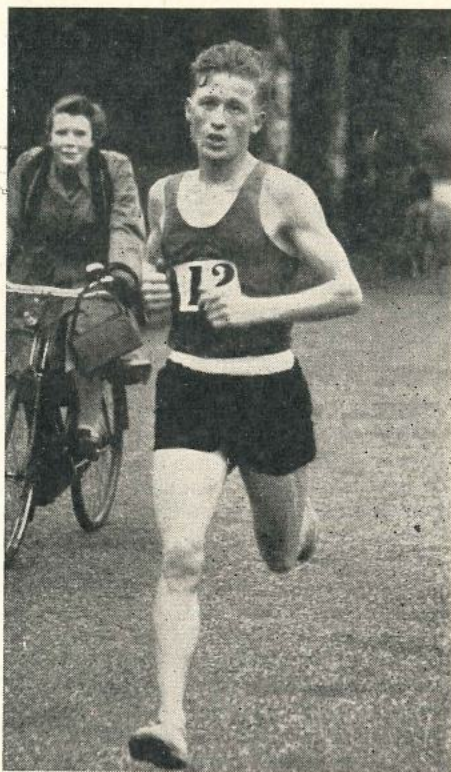
RON CLARK (Herne Hill H.) winning the Walton 10 Miles Road Race.