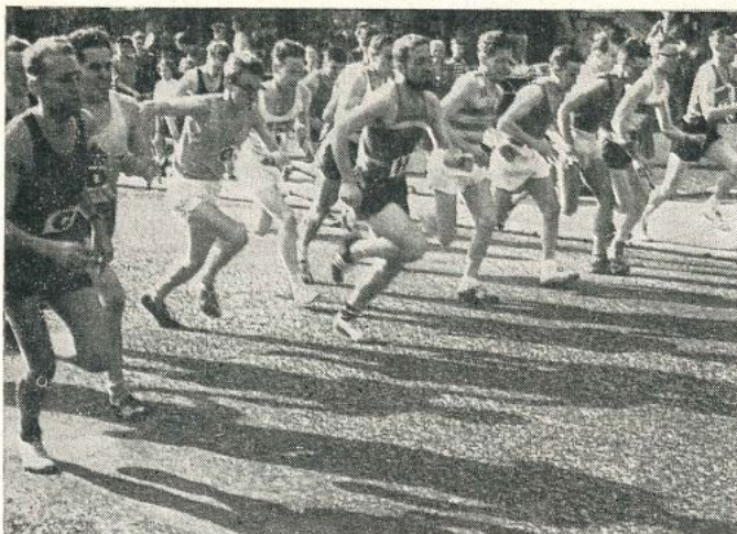
The start of the Withington Road Relay at West Didsbury.