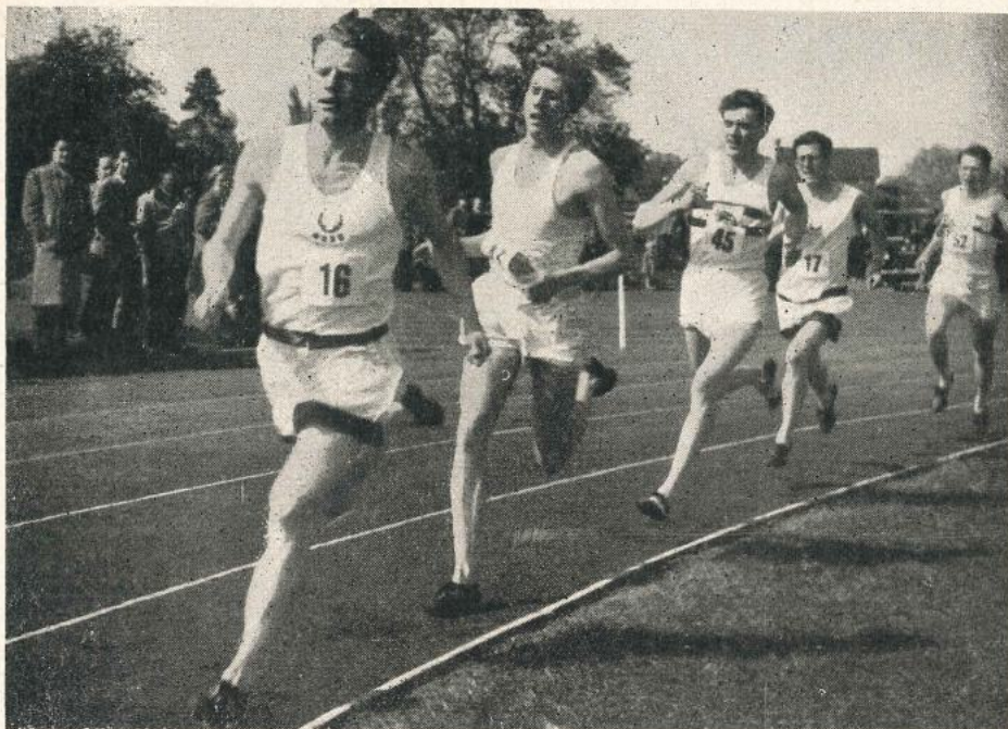
CHRIS CHATAWAY (Oxford) leading from ROGER BANNISTER (A.A.A.) at the first bend of the second lap in the mile, during the match in which an A.A.A. team defeated Oxford University by 96 pts. to 46. Bannister eventually won in the new British All-Comers, British National and English Native record time of 4min. 3.6sec., Chataway dropping out on the last lap after setting the pace for three laps.