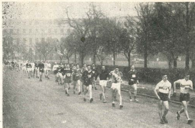
Just after the start of the Middlesex 10 Miles Walking Championship in Regents Park.