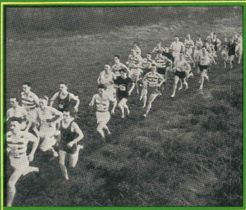
LEADERS IN THE SHEFFIELD & DISTRICT CHAMPIONSHIP