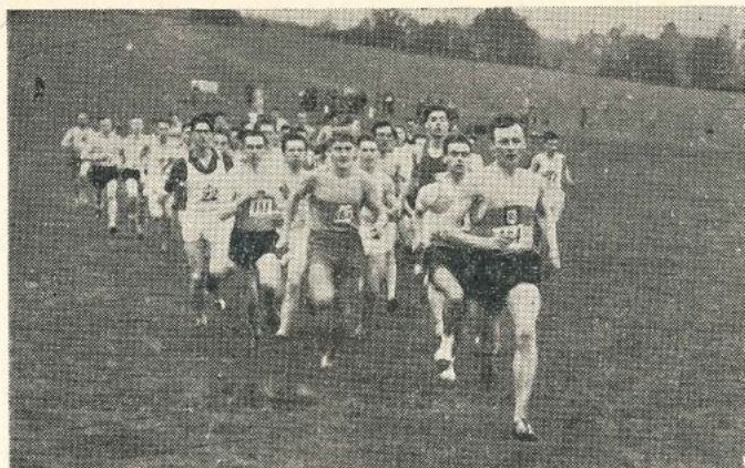
Soon after the start of the Sussex Intermediate Cross Country Championship at Horsham.