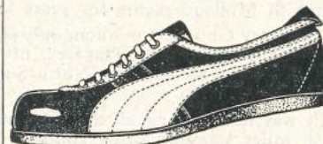
SPALDING NO. 150