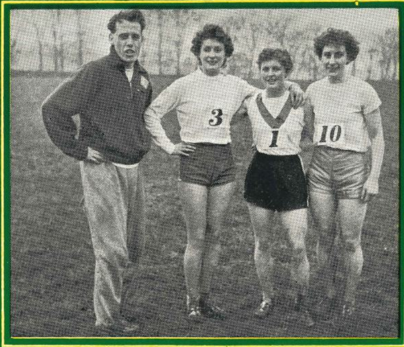
Derek Ibbotson with first three in N.C.W.A.A. Championship