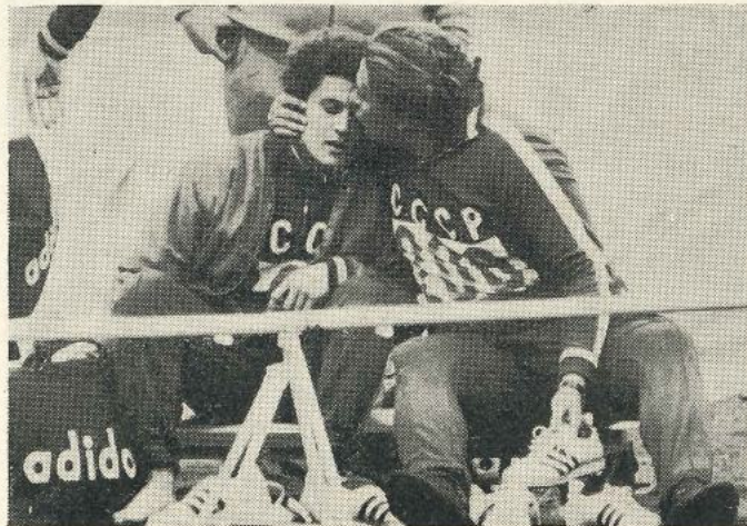
A kiss for Irina Press, the pentathlon champion, from sister Tamara—winner of both shot and discus.

Six gold, a silver and a bronze is the latest Olympic and European medal tally of the elder of the Press sisters. She duplicated Micheline Ostermeyer's 1948 feat of winning both shot and discus, the distances indicating the pro-