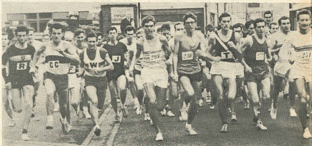
The start of the City of Rochester 5 Miles Road Race

Facts and figures: Born at Tolbuzino on 14.4.42; 6'0½"/1.85 tall, weight 174lb/79kg; student. Annual progress: 1953—3'9¼"/1.15, 1956—4'7¼"/1.40, 1957—5'8½"/1.75, 1958—6'