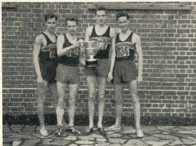
Walton A.C. Youths' team which, this year, has won the Surrey Youths', National Youths', and finished second in the Southern Youths' Cross-Country Championships. They are seen here with the National trophy.